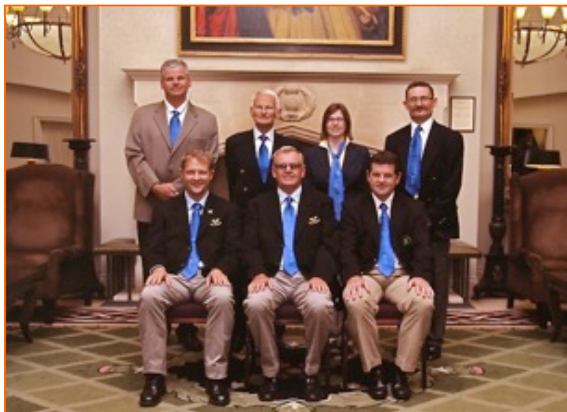
WDGF Board of Directors 2006 - 2010

In the last shivering minutes of 2010, we look back at a fantastic golfing year! Scotland did a good job hosting the World Deaf Golf Championships, we will remember the week in St Andrews for a long, long time. Now, we are in the new year of 2011; the future looks very promising!